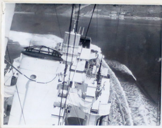
HARD OVER AT 22 KNOTS THE HOME GUARD DRAWN UP FOR INSPECTION.