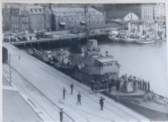
PRINCE OLAF LEAVING 'SLEIPNER'