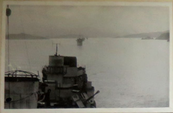
BLACKPOOL, BANGOR and 2 MMS NORTH OF BERGEN