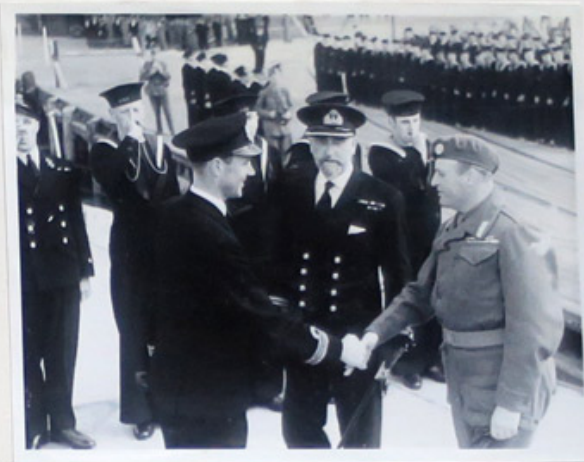
CROWN PRINCE OLAF COMES ON BOARD H.M.S. VICEROY