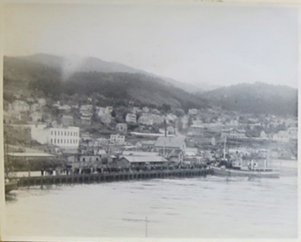
MOLDE, CITY OF ROSKES. THE WATERFRONT HAD BEEN BOMBED FLAT