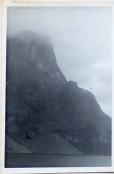
HORNELLEN, 2000 FEET HIGH RISES ALMOST VERTICALLY FROM THE FIORD