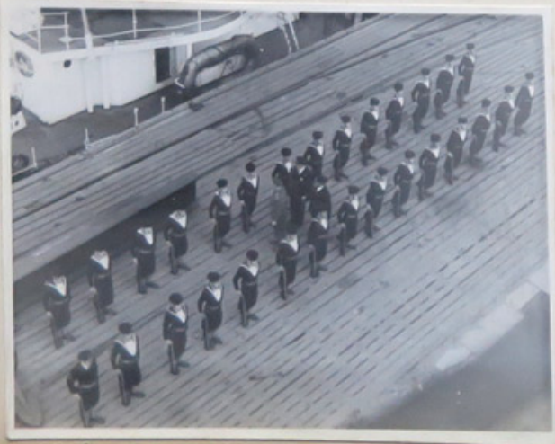
INSPECTING THE ROYAL GUARD