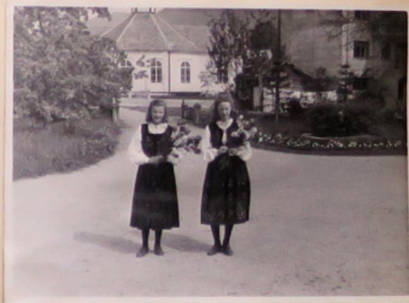
TULIPS ARE PRESENTED BY TWO NORWEGIANS IN NATIONAL DRESS.