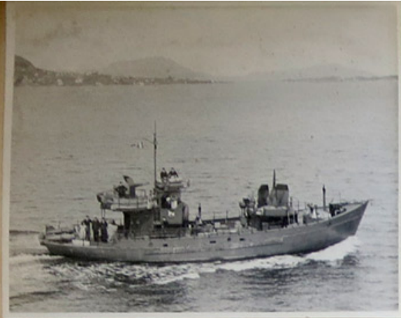
AALESUND To MOLDE

A GERMAN MINESWEEPER FLYING A PENDANT INSTEAD OF THE NAZI FLAG. THEY FAILED TO SALUTE US AND WERE DULY DEALT WITH.