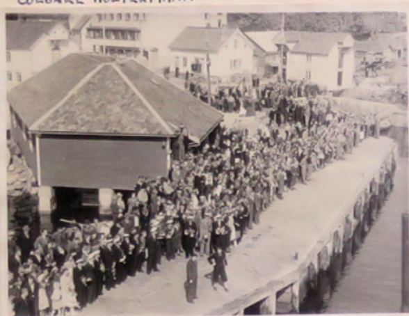
THE ENTIRE POPULATION TURNED OUT TO SEE US