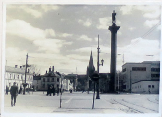
TORVET WITH STATUE OF OLAV TRYGVESON AND CATHEDRAL IN BACKGROUND