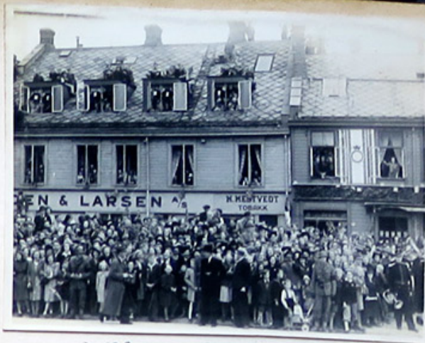
CHEERING CROWDS OPPOSITE THE SALUTING BASE