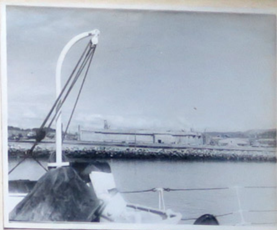
U-BOAT PEN AT TRONDHEIM