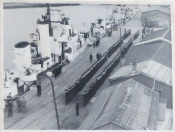
PRINCE OLAF INSPECTING SHIPS COMPANY OF VICEROY