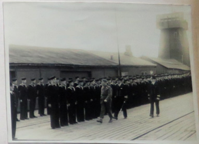
INSPECTING VICEROYS SHIPS COMPANY