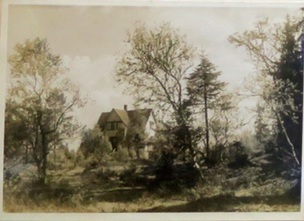
TYPICAL NORWEGIAN SETTING