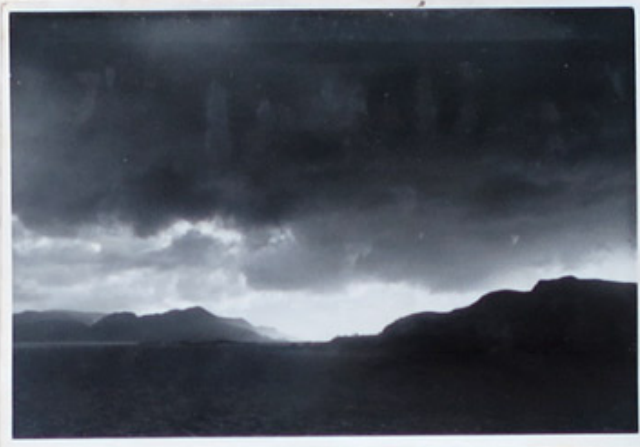
STORM BY STAPLANDET