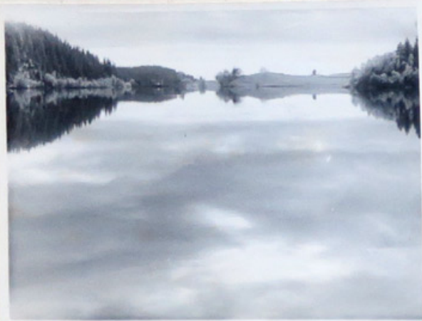
EVENING ON THE LAKE