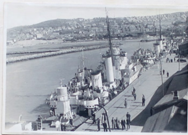
VICEROY and MACKAY ALONGSIDE at TRONDHEIM