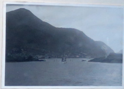
VAAQSO, SCENE OF ONE OF THE EARLY COMMANDO RAIDS. MACKAY IS PASSING THROUGH THE NARROW CHANNEL. THIS WAS IN THE MIDDLE OF THE NIGHT