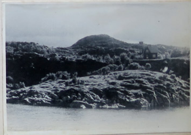
SOUTH OF BERGEN