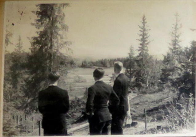
SINCLAIR DOC SEC ADMIRE THE VIEW