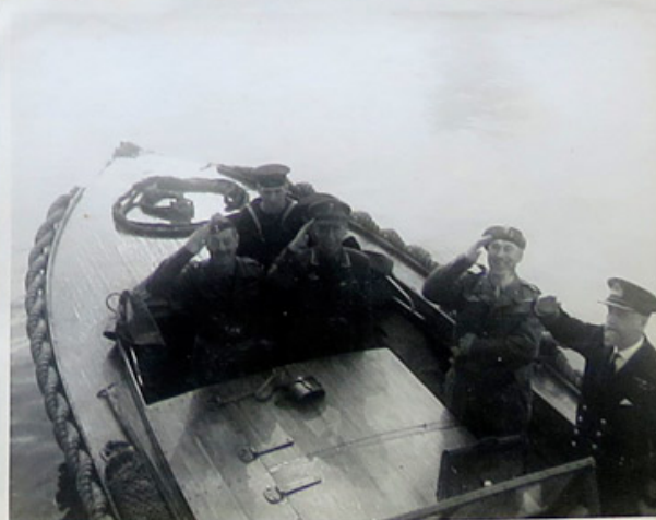
ALL GOOD THINGS COME TO AN END. EVERYBODY THOROUGHLY ENJOYED THE TRIP