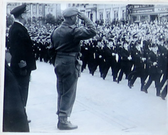
VICEROY SHIPS COMPANY MARCHING PAST