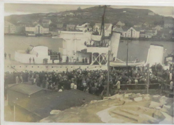
THOUSANDS COME TO SEE US AT KRISTIANSUND (N) IN SPITE OF THE RAIN