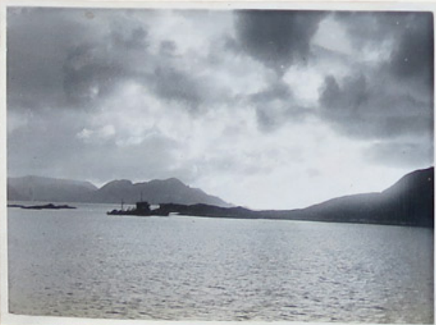
WRECKED GERMAN AUXILIARY