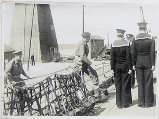
MAJOR GENERAL URQUHART, WHO COMMANDED THE AIRBORNE TROOPS AT ARNHEM, COMING ABOARD VICEROY FOR LUNCH.