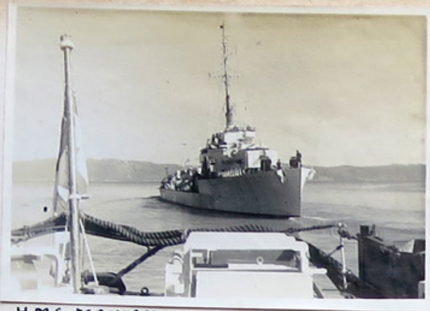
H.M.S. MACKAY LEAVES