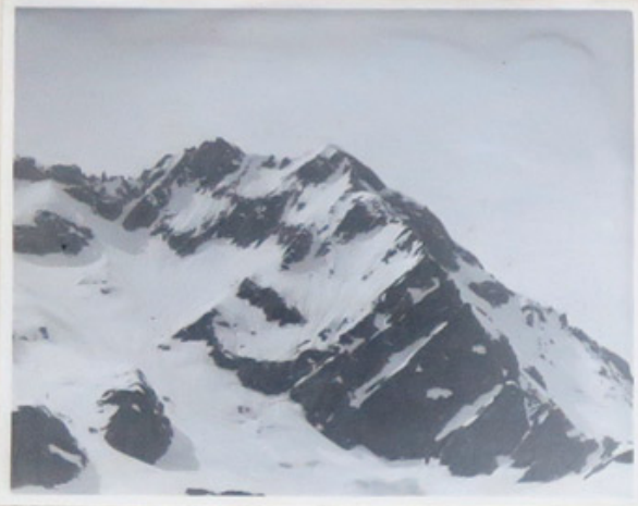
PHOTO TAKEN FROM THE SHIP AS WE DASH UP THE FJORD