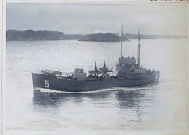
PASSING A GERMAN MINESWEEPER