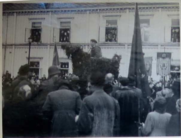
PRINCE OLAF RETURNS TO TRONDHEIM AFTER FIVE YEARS. GIVING HIS SPEECH IN THE POURING RAIN