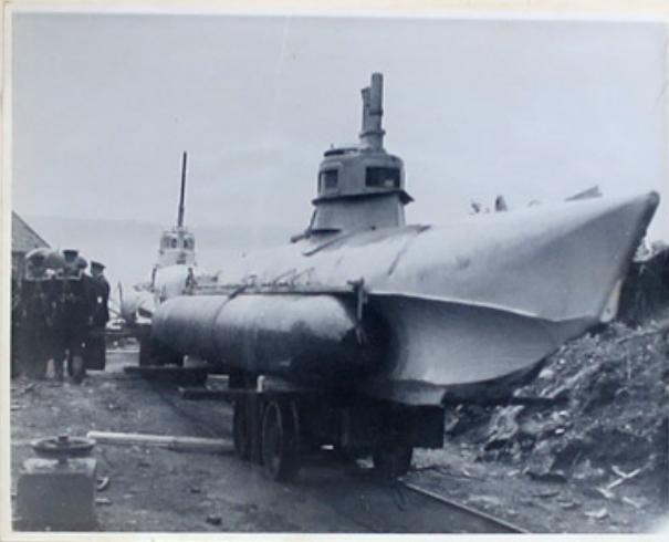
ONE MAN V BOATS AT MOLDE. THERE WERE 21 OF THEM