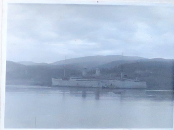
NORWEGIAN LINER STAVANGER FJORD IN LO FJORD SHE IS OCCUPYING THE BERTH WHERE THE TIRPITZ LAY FOR ONE YEAR AND WHERE MIDGET SPW SUCCESSFULLY ATTACKED HER