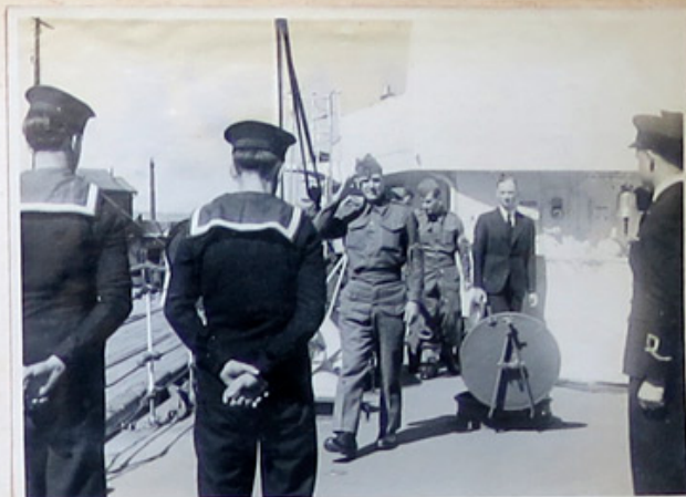
RUSSIAN MAJORS, WHO HAD BEEN PRISONERS OF WAR LEAVE VICEROY AFTER BEING ENTERTAINED. THEY HAD BEEN CLOTHED BY THE BRITISH ARMY