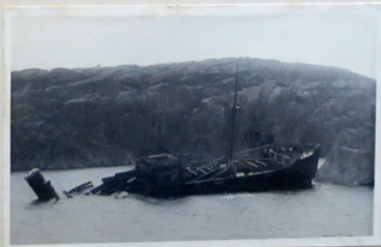
GERMAN COASTER DAMAGED BY THE R.A.F. RUNS ON A ROCK TO