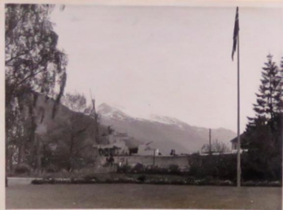
VICEROY AT THE BOTTOM OF THE GARDEN