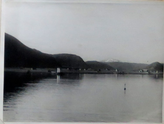
PLACE MARKING THE MOUTH OF AALESUND