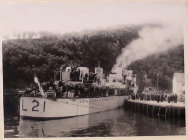
OPEN TO VISITORS AT STRANDA