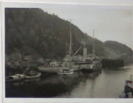
GERMAN ADMIRALTY YACHT GRILLE. WHEN MOSQUITO AIRCRAFT ATTACKED THIS FLOPPY NINE OUT OF TWELVE MACHINES DIVED INTO THE MOUNTAINSIDE